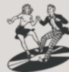
Danville Shag at Myrtle Bch